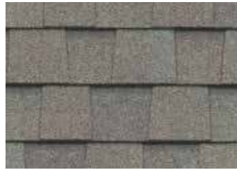
Solaris Aged Cedar CRRC Product ID 0668-0055