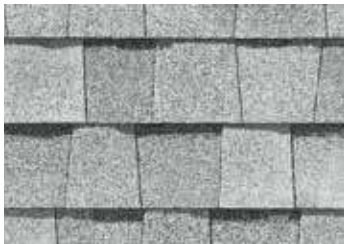
Silver Birch CRRC Product ID 0668-0072