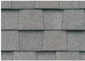
Solaris Crystal Gray CRRC Product ID 0668-0058