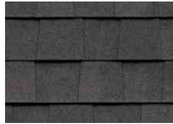
Solaris Graphite CRRC Product ID 0668-0155