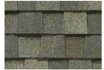
Solaris Weathered Wood CRRC Product ID 0668-0119