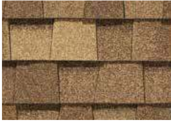
Solaris Resawn Shake CRRC Product ID 0668-0118